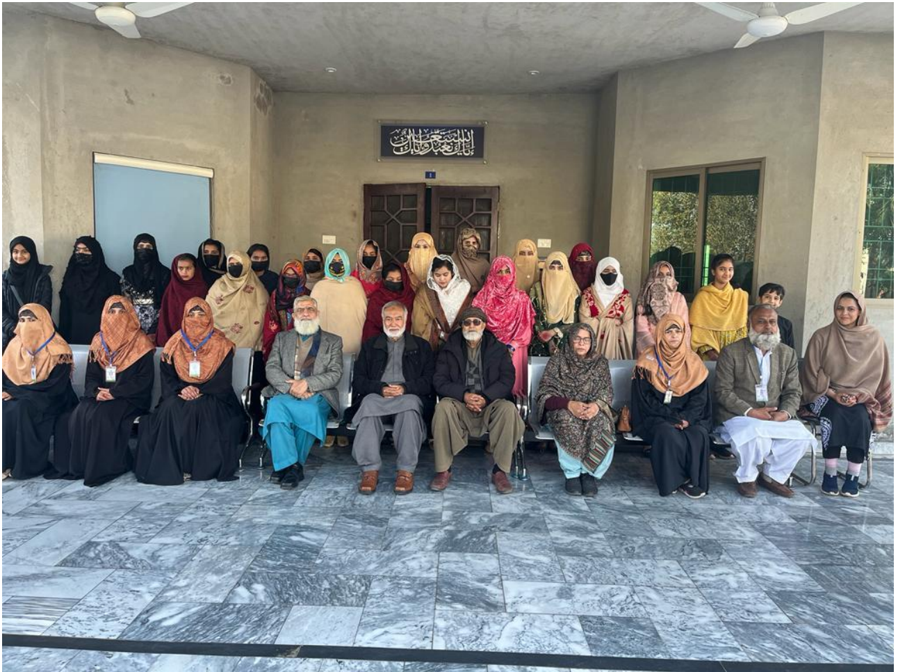
Group Photo of Successful Students with the Chief Guest at VC 118 NB, Sillanwali, District Sargodha