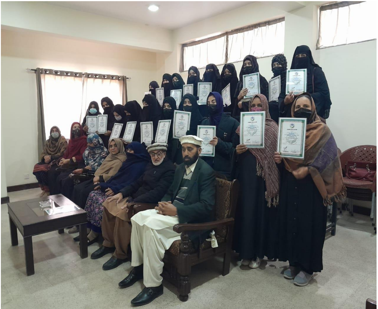
Group Photo of Qualifying Students of VC Rera (Bagh), AJ & K