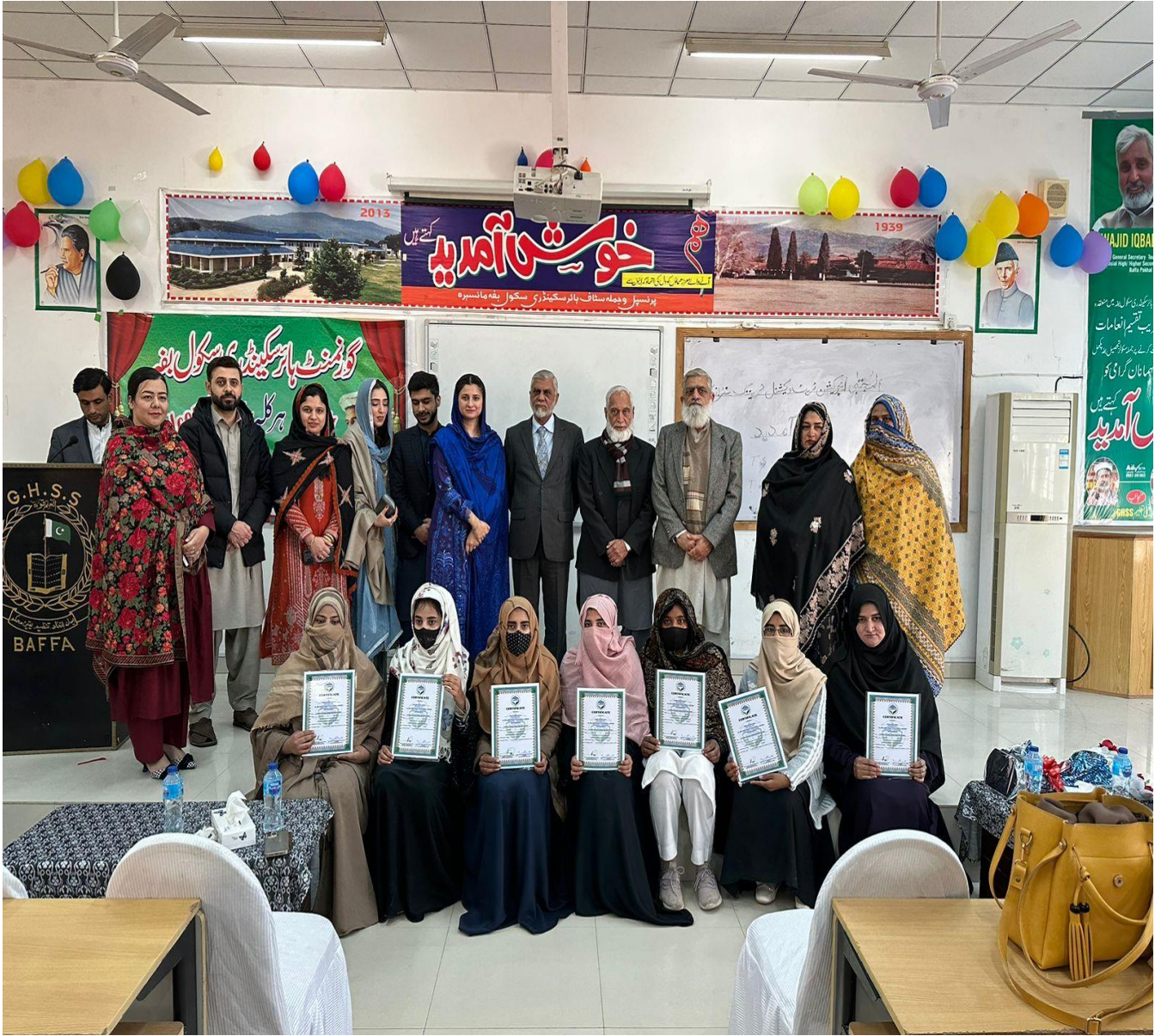
Group Photo of Successful Students with Chief Guest at VC Baffa (Mansehra)