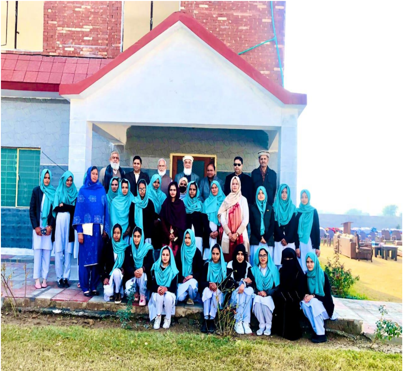
Group Photo of Successful Students with the Chief Guest at VC Bucha